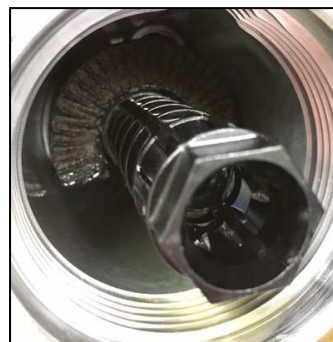
View inside housing – note end cap

Manufacturer Corrective Actions have been put in place as of March 1, 2017. These actions have been in place to ensure a more robust endcap assembly, confirming greater continuity in quality. The improved production filters are now beginning to ship. However, we advise that you continue this special inspection for the next few months, as older affected inventory may be in use until subsequent oil & filter changes.